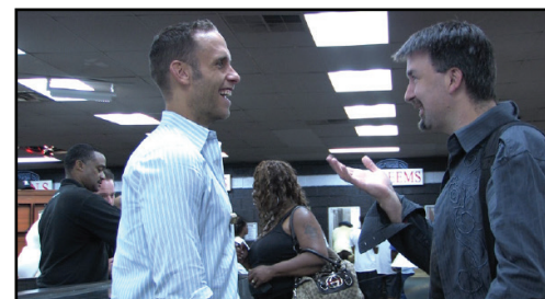
On the set of Pawn Detroit, a Time Warner/TruTV reality show