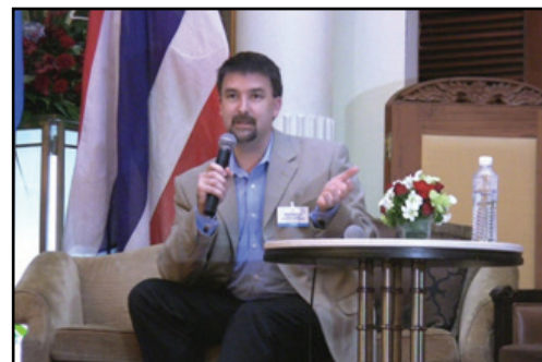
Presenter at the United Nations' Second Global Forum on the Power of Peace in Bangkok, Thailand.