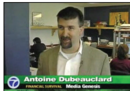
Interview with WXYZ Channel 7.