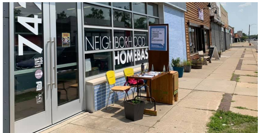
Roaming Conversation at Neighborhood HomeBase

Detroit Public Schools Community District IFF Marygrove College Marygrove Conservancy Starfish Family Services & Development Centers, Inc. The Kresge Foundation University of Michigan