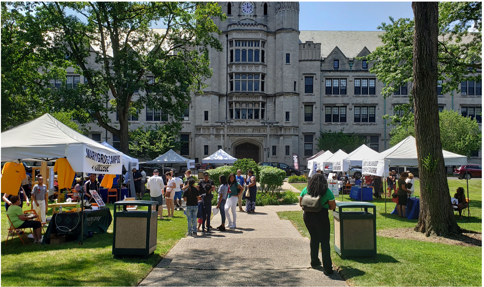
Community Cook-out on Marygrove Campus