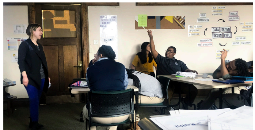
Focus Group with High School Students